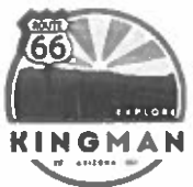
City of Kingman, Arizona