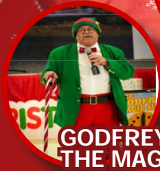
GODFREY THE MAGIC ELF

Wristbands will be sold at the event. Children 2 and under are free. Wristbands are required for rides and inflatables.