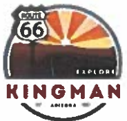
City of Kingman, Arizona